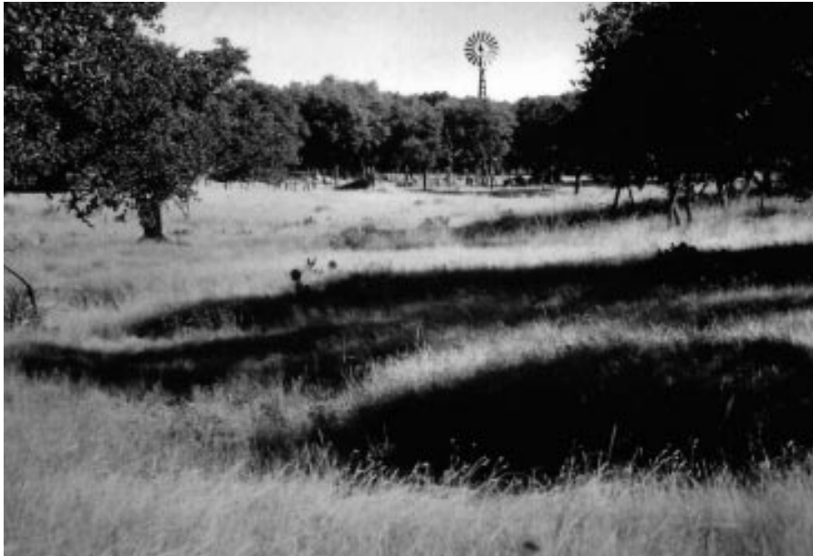
Figure 2. "Hiring" a good lessee who manages your property to meet your needs produces a stable range resource. A good lease is a viable opportunity for the lessor and the lessee.

management plan for the use of the property (Figure 2). This plan should reflect the goals of the landowner as well as the tenant and should include an initial inventory of resources. The resources available as well as the goals of each party must be understood if a proper lease is to be developed.