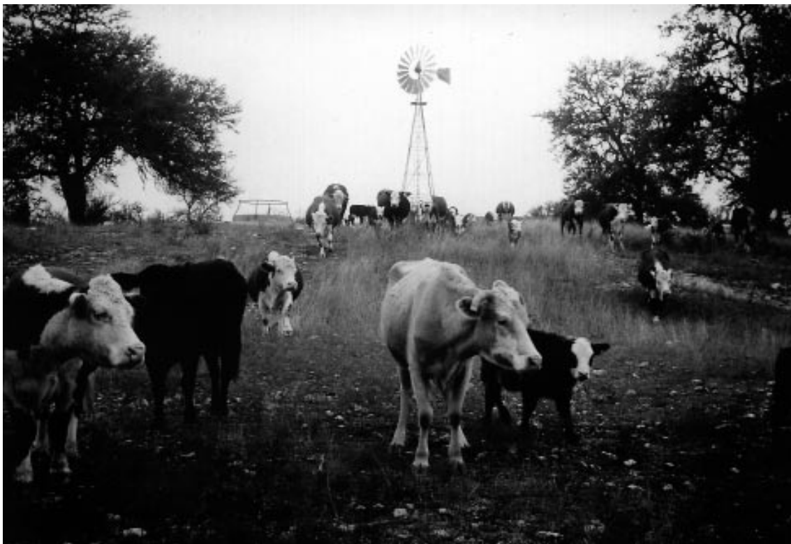
Figure 1. Poor management can result in destruction of the resource . A good lease should spell out adequate resource requirements and be priced so that a lessee is not "forced" into overgrazing to meet short-term debt obligations.